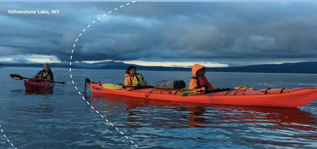
Yellowstone Lake, WY