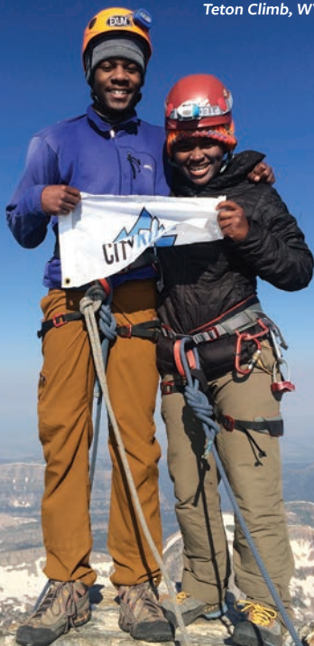
JET Grand Teton Climb, WY