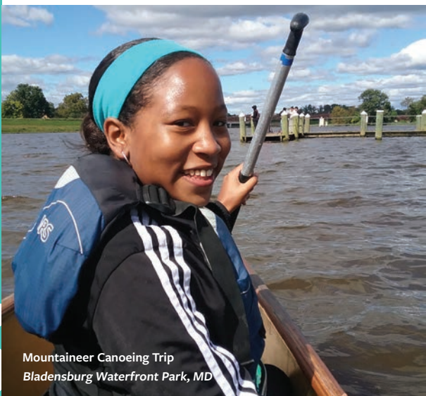
Mountaineer Canoeing Trip Bladensburg Waterfront Park, MD