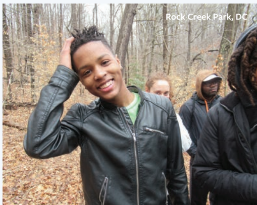
Rock Creek Park, DC