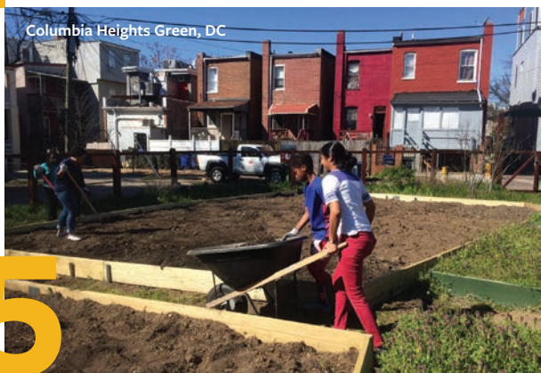
Columbia Heights Green, DC