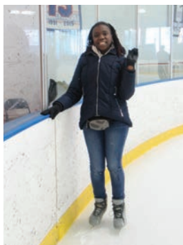
Fort Dupont Ice Arena, DC