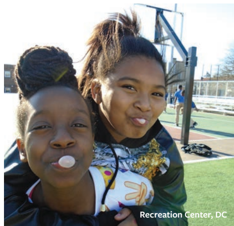
Recreation Center, DC

Week-long kayak trip in the rivers, swamps and ocean of South Carolina