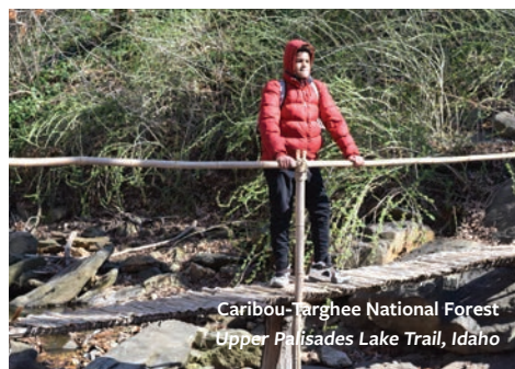
Caribou-Targhee National Forest Upper Palisades Lake Trail, Idaho