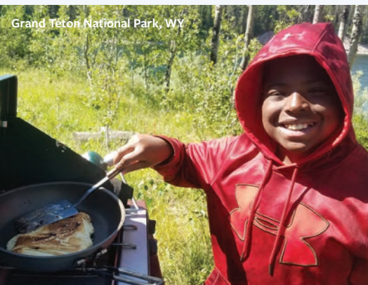
Grand Teton National Park, WY