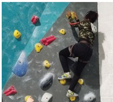
Sportrock Climbing Center, Alexandria, VA