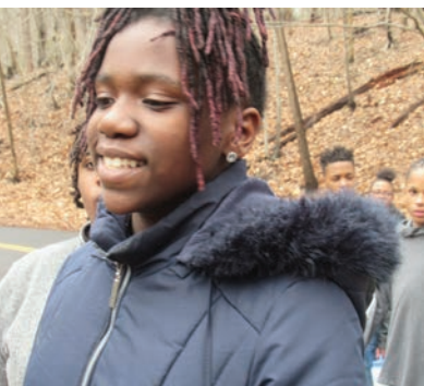
Rock Creek Park, DC

I've learned through City Kids that when times get hard, and you really struggle, keep pushing forward, because in the end you'll really feel good about yourself for actually doing it.